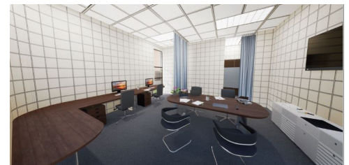
Supported Employment Resource Center

The newly designed fitness room will be space created to inspire individuals to choose an activity to improve their physical health. The space will consist of equipment for individuals with varying physical abilities, including a treadmill, stationary bike, hand weights, stretch bands, balance balls and weighted hula hoops.